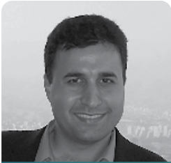
Coaching for Success and Conflict Management