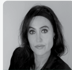
Emotional Intelligence and Communication Skills