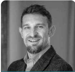
Coaching for Success and Conflict Management