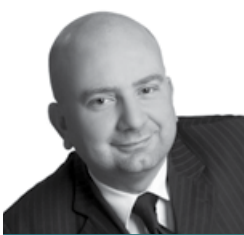
Strategic Planning and Emotional Intelligence

Head of Practice at Leoron and Non-Executive Director/ Advisor and innovation specialist with a career in international business and project management and the development of business to business services spanning 30 years.